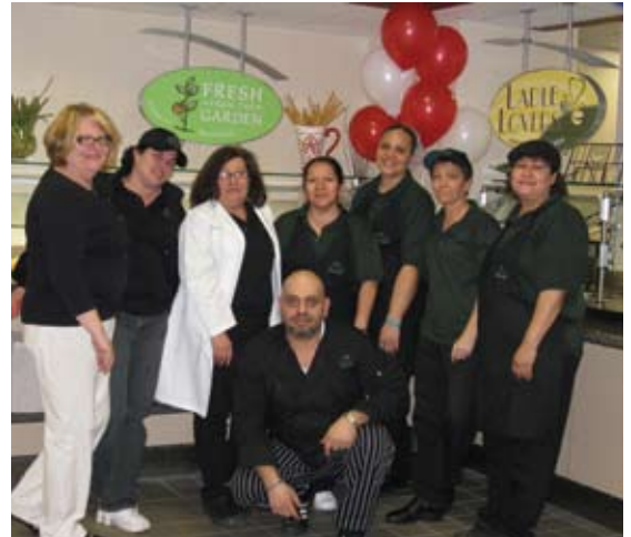
(Top) The new cafe; (Bottom) The hardworking team behind Tarrytown’s success