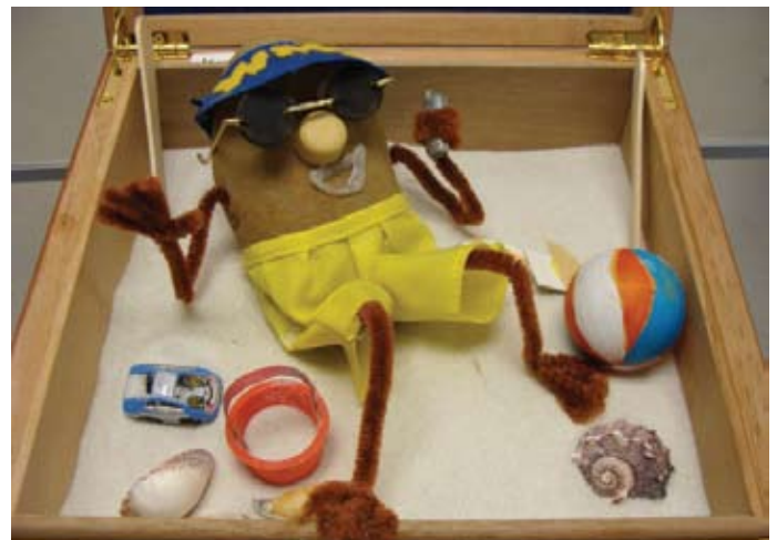
Favorite pics from our winning team submissions